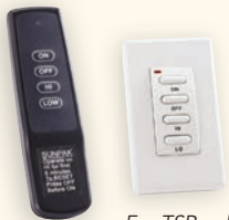
For TSR only

Optional fascias are also available in Gloss Black and Antique Bronze.