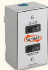
On-Off/Hi-Lo Duplex switch is included for easy control of Sunpak TSH

Optional fascias are also available in Gloss Black and Antique Bronze.