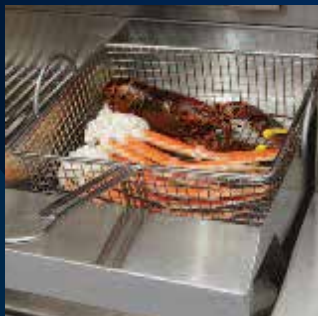
Steamer, Fryer, Pasta-Cooker