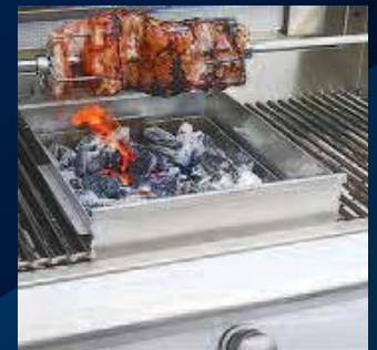
Solid Fuel Insert

*ONLY SPECIFIC ITEMS QUALIFY. QUOTED PROJECT PURCHASES ARE EXCLUDED. REBATE FORM & PROOF OF PURCHASE SUBMISSION REQUIRED